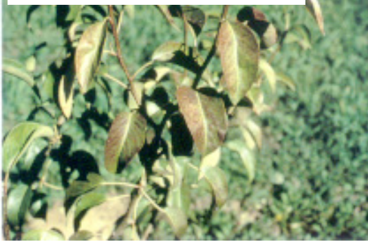
Figure 2: Phosphorus

The status of an orchard soils P supplying power can be difficult to determine, even with the best soil testing program. Fruit trees are deep rooted and can absorb P throughout a deeper soil profile than annual crops. Therefore they are using soil P that isn't identified by normal soil sampling. Apple trees also absorb P over a long portion of the year, and most soil test calibration assumes a somewhat shorter uptake period. Of course other soil factors such as pH, temperature, moisture, compaction, etc. (at all rooting depths) also affect P uptake. With all of these complications, it may seem futile to take a soil sample, however it remains a fact that a healthy tree will take up more P from a high testing soil than a low one, so periodic soil testing is still a recommended practice. These