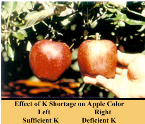
Effect of K Shortage on Apple Color Left Sufficient K Right Deficient K

Soil Applications: Apples are very responsive to potassium, so a strong soil test, and sound fertility program are vital to top yields. Soil K status is a function of the test level and the soil CEC; therefore no single table can list the desired levels.