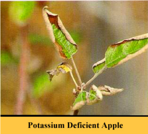
Potassium Deficient Apple

Adequate potassium contributes to improved fruit size, color and flavor. It is also a major factor in reducing winter injury, spring frost damage to buds and flowers, and generally reduced incidence of diseases. The benefits of adequate potassium can be lost however, if the leaf ratio of nitrogen to potassium (N divided by K) is too high. Low N trees such as McIntosh do better with an N:K ratio of about 1:1 to 1.25:1, while high N trees such as Red Delicious should have a ratio of about 1.25:1 to 1.5:1. Where leaf analysis shows N and K are sufficient, but the ratio is high, the annual K_2O should be increased to correct the leaf balance.